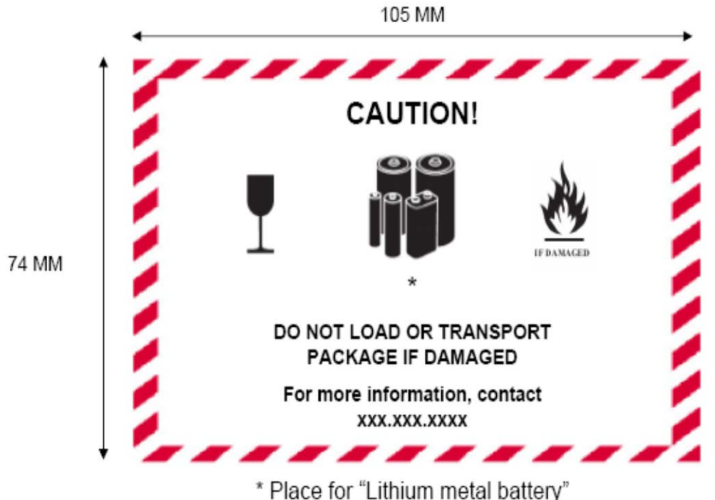
or "Lithium ion battery"

Where the packages are of dimensions such that they can only bear smaller labels the label dimensions may be 105 mm wide \times 74 mm high. The design specifications remain otherwise the same.