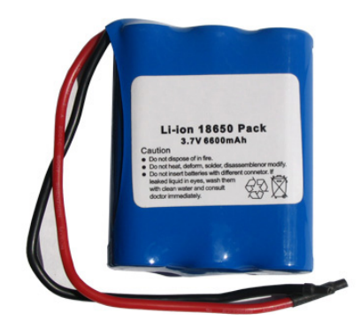
Figure 2 - Example of a Lithium Ion Battery

Lithium-ion batteries (sometimes abbreviated Li-ion batteries). Are a type of secondary (rechargeable) battery commonly used in consumer electronics. Also included within the category of lithium-ion batteries are lithium polymer batteries. Lithium-ion batteries are generally found in mobile telephones, laptop computers, etc.