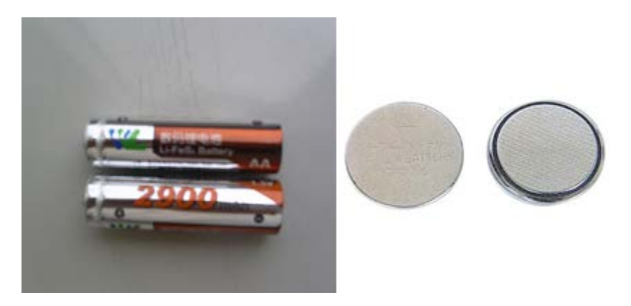
Figure 1 - Example of Lithium Metal Batteries

Lithium metal batteries packed by themselves (not contained in or packed with equipment) (Packing Instruction 968) are forbidden for transport as cargo on passenger aircraft).